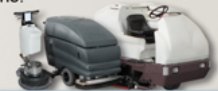
Works On Standard Rotary Machines

Once the required brushes are determined, you are ready to begin the coating removal process! Please contact a Diamabrush™ representative at our customer service line at: 1 (855) DB-TOOLS with any questions or concerns.